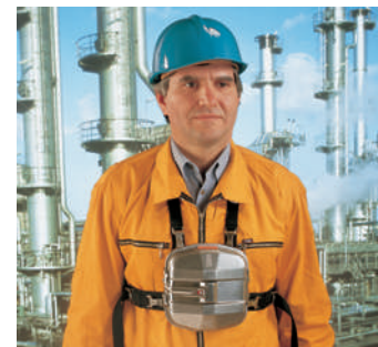
SSR 30/100 B