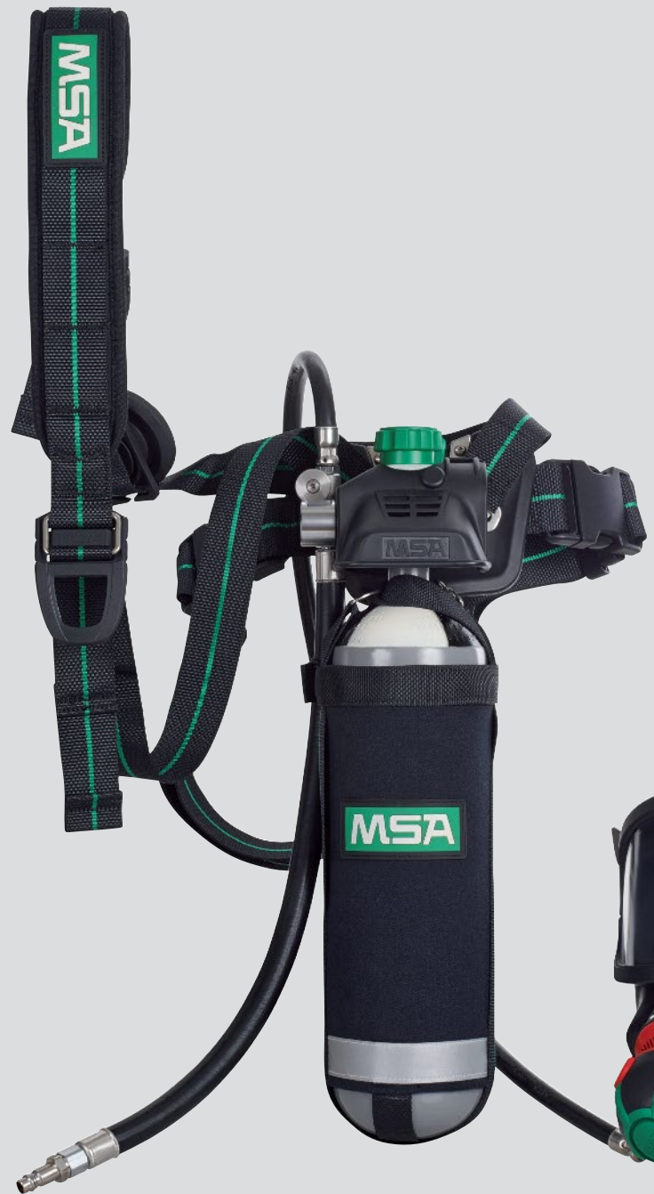
PremAire Combination with 3S-PS-MaXX and AutoMaXX-AS