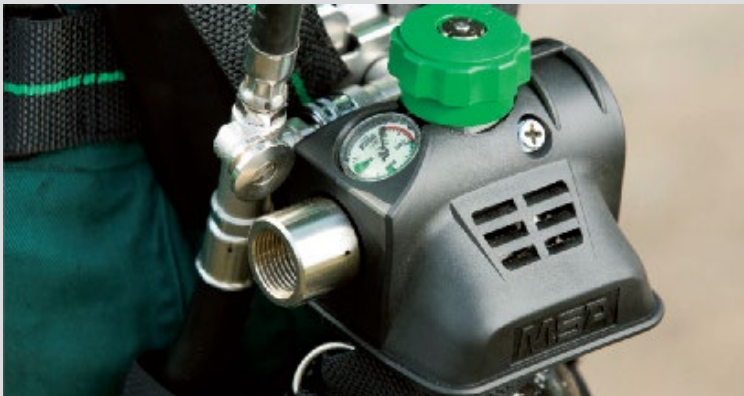
With the filling port fitted on the pressure reducer, all cylinder options can be conveniently filled by a 200 or 300 bar compressor without the need to detach the harness assembly or cylinder.