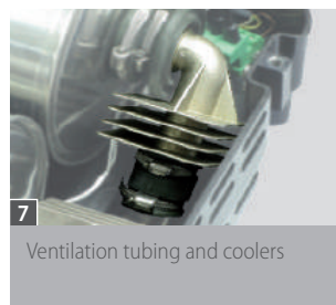
7 Ventilation tubing and coolers