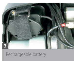
3 Rechargeable battery