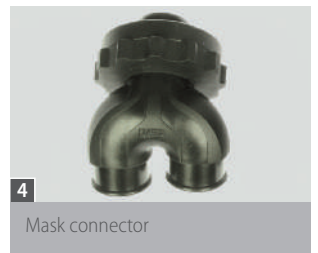
4 Mask connector