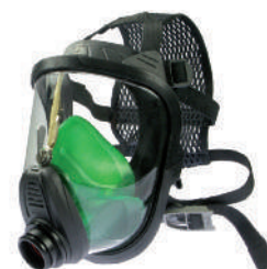
Advantage 4000 AirElite