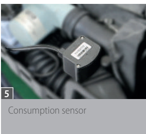
5 Consumption sensor