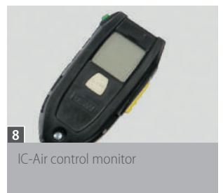
8 IC-Air control monitor