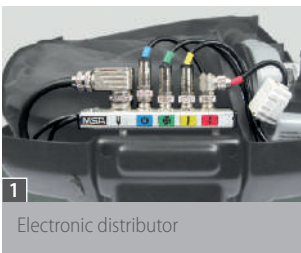
1 Electronic distributor