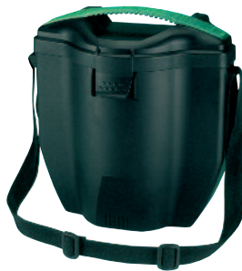
Advantage 3000 container

The weight of a single filter shall not exceed 300 g when used with the Advantage 410