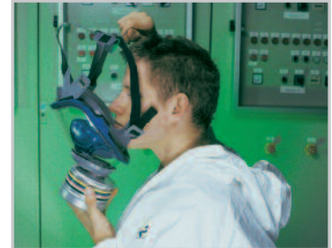
Put your chin into the chin cup