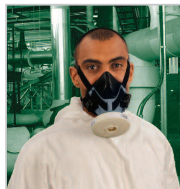
Advantage 410 with P3 PlexTec filter

For detailed information on standard thread filters please see leaflet 05-100.2.