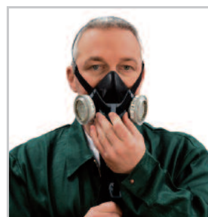
Pull down front straps and lock lever