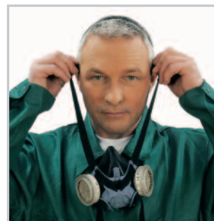
Place cradle on head