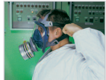
Tighten the two lower straps

The full face mask series Advantage 3000 provides both protection and unparalleled comfort. The soft sealing line made of hypo allergenic silicone provides a pressure-free fit. The large, optically corrected lens ensures a clear, undistorted view, while the grey-blue colour gives the mask an aesthetic appearance.