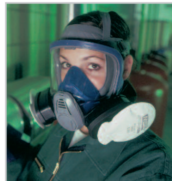
Advantage 3200 with TabTec and FLEXIfilter

The three filter lines are for use with Advantage 3200, Advantage 200 LS and Advantage 420.