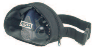
Pouch for Advantage 200 LS