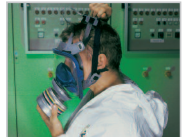
Pull the harness over your head