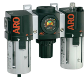
Filters, regulators, lubricators For the complete range, see our accessory catalogue.