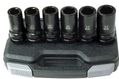
SK6M6L 81287401 3/4" Impact socket set (6 pcs) (24, 27, 30, 32, 33 and 36 mm)