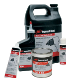
Lubricants For the complete range, see our accessory catalogue.