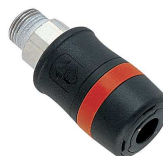
Quick Release Couplings For the complete range, see our accessory catalogue.