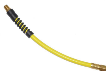
33204 91486357 Hose whip, 3/8" NPT, 10 mm inside diameter, 30 cm (1 ft)