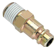
77NMC3 88104088 7N7/7S7 Series nipple, 3/8" male thread, 7.2 mm bore (EURO 7.2 - 7.4)