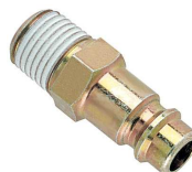
IB8NMC3 88103304 IBN/IBS Series nipple, 3/8" male thread, 8 mm bore (ISO6150B / MIL-C4109)