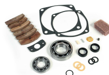
2145-TK2 47100011 Motor service kit