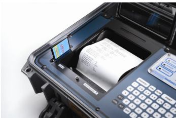
Removable 128 MB CompactFlash™ memory card able to record 10,000 full waveform events.