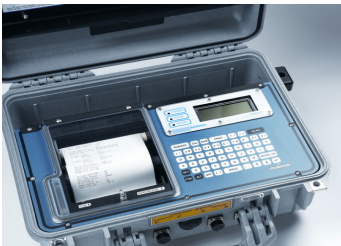
A full QWERTY keyboard, 80 character LCD screen and thermal printer make the SSU 5500 very user friendly.